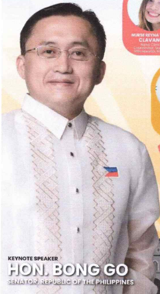
KEYNOTE SPEAKER HON. BONG GO SENATOR, REPUBLIC OF THE PHILIPPINES